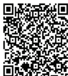
MERIT AUDITION APPLICATION